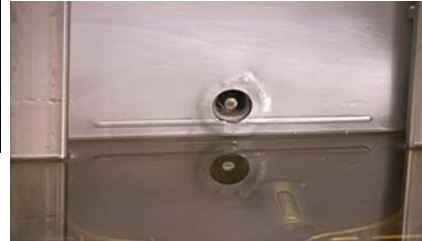
Oil is shown rising toward top-off probe.